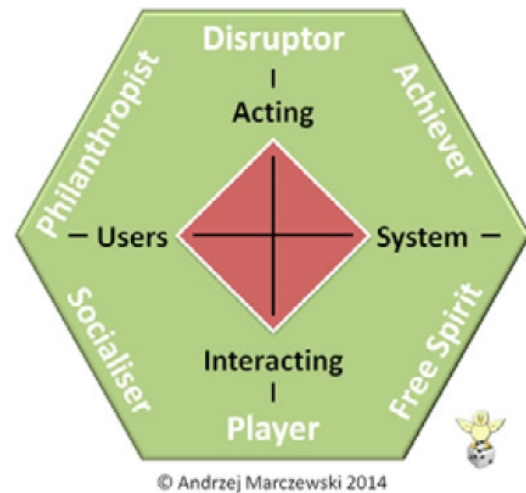
Figure 5. Types of users in gamified systems (Marczewski, A., 2014)

Another more complex players segmentation theory is Andrzej Marczewski's users segmentation model in Gamification. Again it is based on Bartle's segmentation profile but it explores motivational facts in more depth. Marczewski adds a third axis to the model, in this case related to users' motivation-related needs. This third axis is based on the intrinsic vs. extrinsic motivation discussed above. Marczewski argues that the four kinds of Bartle's player types can be applied to both intrinsic and extrinsic motivational profiles, which leads to a 6 player types model. In one hand, he identifies 'non willing to play users', which need to be provided of extrinsic motivation to engage and motivate them. On the other hand, he defines 'willing to play users' as those who are more keen on receiving intrinsic motivation. As can be seen in the following graph, it becomes a considerably complex segmentation model.