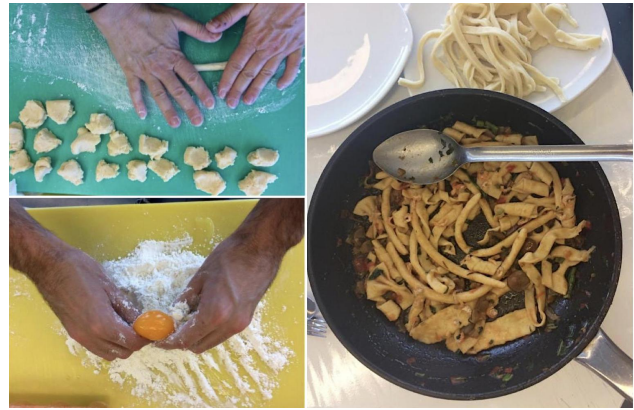
Figure 2: Experimenting with sensorial food engagements.

Key takeaways: HFI designs should support creative and experimental food experiences, attending to the full organoleptic experience of food, rather than deliver quick-fix solutions aimed at consumer convenience.