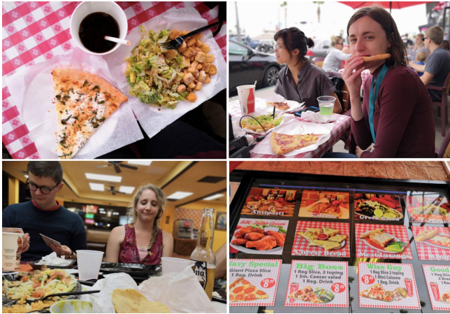
Figure 10: Eating and debating examples of ‘bad’ food at DIS.

The DIS’19 walk-shop was held around the San Diego SeaWorld resort (the conference venue). This location provided a controversial context for exploring food culture. Dining options consisted of expensive hotel restaurants, fast-food chains, and pizza parlours. We acknowledged our privilege of having ‘the luxury of choice’ in this extreme foodscape and took lunch in a local pizza joint. While eating pizza and sipping soda from gigantic plastic cups, we talked about unequal socio-economic access to ‘good’ (healthy, sustainable) food products and technologies designed to support ‘good’ food practices (Figure 10). Unhealthy and unsustainable diets are commonly associated with lower incomes [19,29]. Similarly, food-tech products designed to support better food lifestyles are often available only to people from privileged socio-economic backgrounds. Non-access due to income, education, or illiteracy can marginalise entire social groups. While feasting on our plastic-pizza lunch, we discussed the importance of HFI technologies being accessible to diverse socio-economic publics. If we are to avoid exacerbating existing, or creating new, inequalities on the global food market, we need to pay attention to existing socio-economic sensitivities.