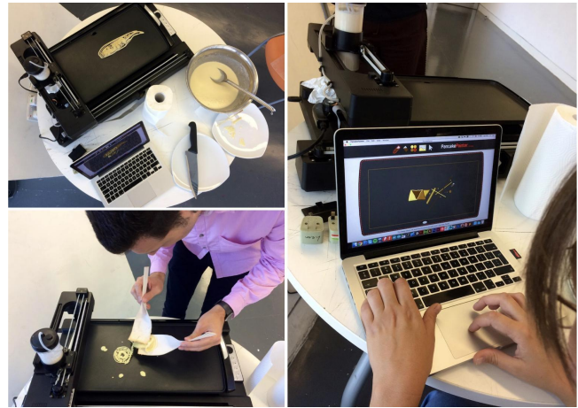
Figure 1: Automated pancake-making with PancakeBot.

Our debates were provoked and extended through co-creative experimental food design activities including 1) experimental cooking & food crafting, 2) situated food-play design, 3) critical food futuring & speculations, 4) reflecting through food-related boundary objects, 5) local food foraging and tasting, and 6) HFI mapping and zine-making. We deployed a variety of bespoke food design props and kits, such as Food Tarot cards [28] to provoke future food imaginaries, the Fun'o'meter to assess playful food traditions (see below), and the HFI Lit Review App [3] to search and categorise the corpus of related research publications. Supported by these tools, the workshop activities provoked critical and creative engagements of diverse HFI stakeholders in collective sense-making of