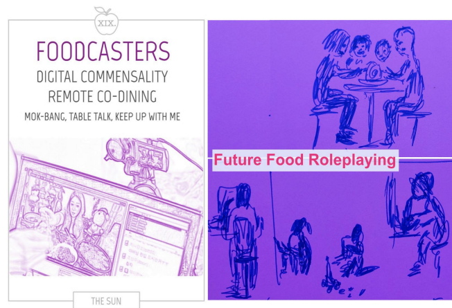
Figure 6: Future Food Roleplaying. To revive food-related memories, users are assigned to a dining group and assume a specific social role (e.g., in a family: mother, child, grandparent etc.) Gathered around a virtual dinner table, they re-enact food-related memories that might be hard to experience otherwise, e.g. a family Christmas feast from years ago.

To provide an example, a participant recounted her relationship to Pavlova – a tutu-shaped meringue-based dessert covered in cream and fruit, named after the ballerina Anna Pavlova. The dessert was a family favourite and her grandmother's signature dish. However, the grandmother consistently considered her Pavlova a failure. As a money-saving strategy, she would use three eggs instead of six. As