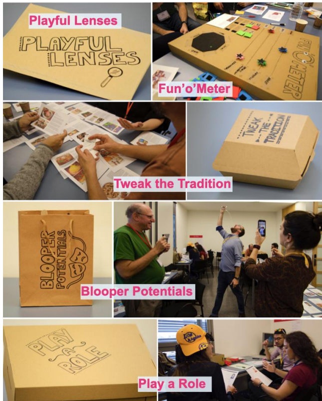
Figure 3: Chasing food-play potentials in food traditions.

These tools were inspired by design research approaches ranging from analytical strategies (e.g. using theoretical frameworks [5]) to embodied design research methods (e.g. embodied sketching [25]). Working with the tools in small groups, we explored the proposed traditions, identified play potentials, and documented our findings on post-its (Figure 3). All groups then shared their play potentials and we used thematic analysis to uncover recurrent patterns and mechanisms. Building on our findings we regrouped and rapid-prototyped food-play experiences, artifacts, and technologies inspired by the identified play potentials. We worked with diverse lo-fi prototyping materials including food ingredients, utensils, and Play-d'Oh as well as rapid prototyping technologies such as a Makey Makey board.