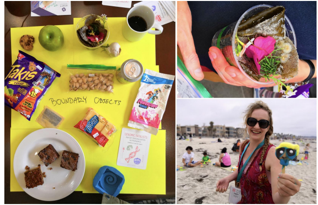
Figure 11: Foraged ‘good’ and ‘bad’ food boundary objects.

The two foraging walk-shops illustrate the situated nature of human-food practices. They reminded us that such practices cannot be adequately interpreted from a research