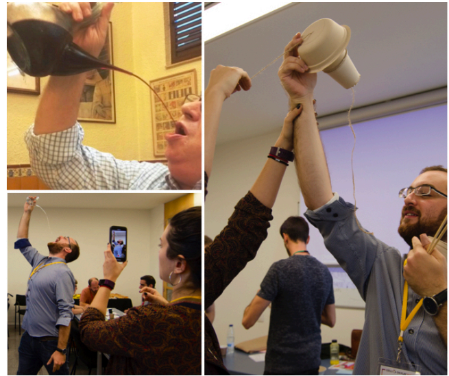
Figure 4: Sequence of a play-food potential chased within a Catalan tradition El Porró .

The embodied food prototyping inspired by the food-play design toolkit enabled us to reclaim experiences with food that are grounded in cultural practices. It focused our attention on local, traditional food knowledge rather than