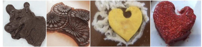
Figure 8: Experimental 3D printed food items – a melted chocolate, gelatin agar mix, egg yolk, and frozen popsicle.

At the workshop, we further considered how traditional