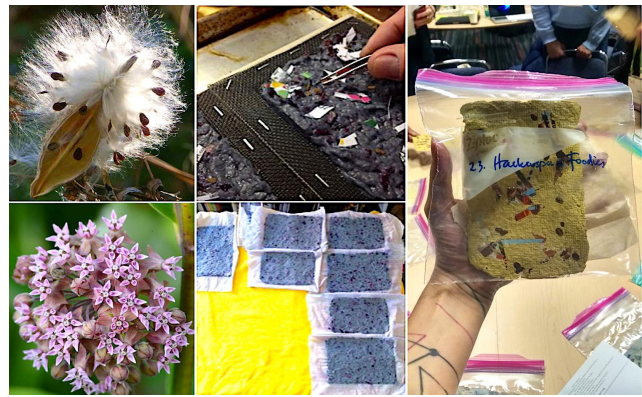
Figure 9: Collective crafting of a CHI Food Tarot card made of foraged food-related materials.

Food waste foraging in the CHI corridors was inspired by a ‘locavore’ version of the Food Tarot card deck. Before the workshop, a group of local participants mapped all 22 Food Tarot cards with local food venues (e.g. Gut Gardeners with a local fermentation workshop and Food NeoPunks with the Loop Juice shop that makes juice from leftover fruits [16]). From each of the 22 venues, they acquired paper-based waste, such as discarded food wrappings and used them as