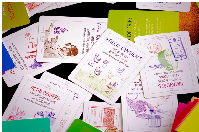
Figure 5: Food Tarot cards and future diet tribes. e.g. Petri Dishers only eat lab-grown meat, Datavores are Quantified Self dieters, Ethical Cannibals tweak their microbiome to grow food in and on themselves. Full deck: [28].

Ministry of Quantified Health. The Ministry designs meals for all citizens according to their data records, ignoring personal preferences. The objective is to keep everyone fit, efficient, and thriving. In this scenario, citizens have extremely limited control over their food practices. Their lifestyles become fully data-driven and manipulated in a top-down manner. Similar dystopian proposals for top-down health-diet data tracking exist in sci-fi literature [21], design fiction [8] and commercial food services [40]. At the workshop, the Total Food Control scenario provoked a debate on security aspects of diet tracking technologies. While quantified control over personal diets may help improve consumers' health, such data tracking risks privacy infringements from third parties – a nuance that must be taken seriously in HFI to support ethical diet tracking.