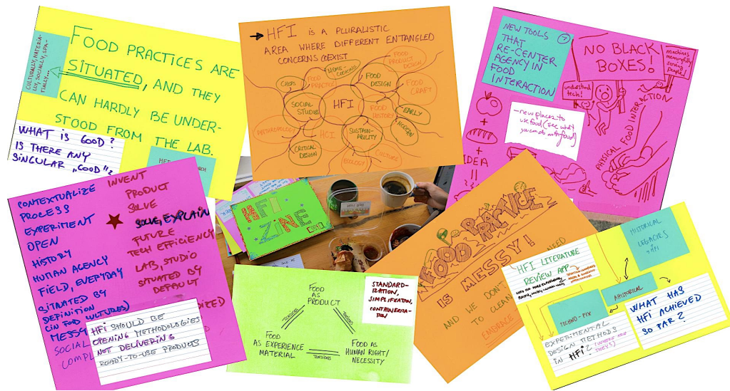
Figure 12: HFI Zine collectively initiated at DIS'19 workshop.

medium to organize thoughts-in-progress in a visually appealing way and disseminate them beyond the workshop, in an open-access format, designed to reach diverse audiences. The HFI Zine was later extended with findings from all FFF workshops and self-published online [18].